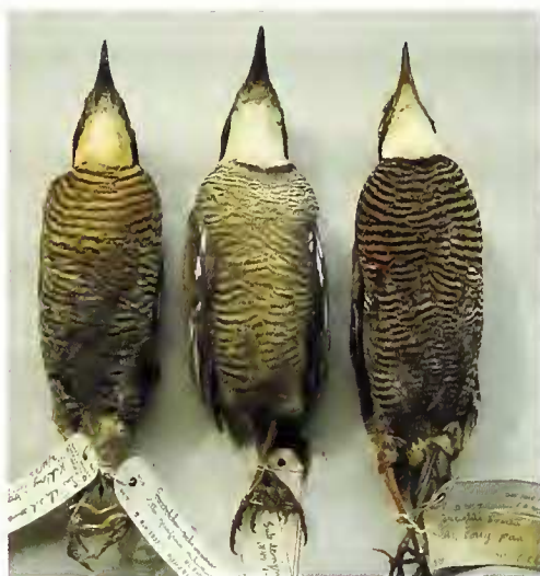
Plate 4. Banded Pitta females (ventral view): left to right, P. g. schwaneri, P. g. guajana and P. g. irena.